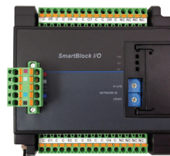
SmartBlock Specialty I/O