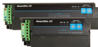
SmartStix Terminal Block I/O