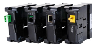
XL Series COM Options