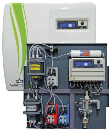
LOTUS AIR 10 with probe measure