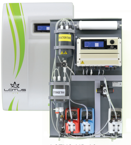
LOTUS AIR 10