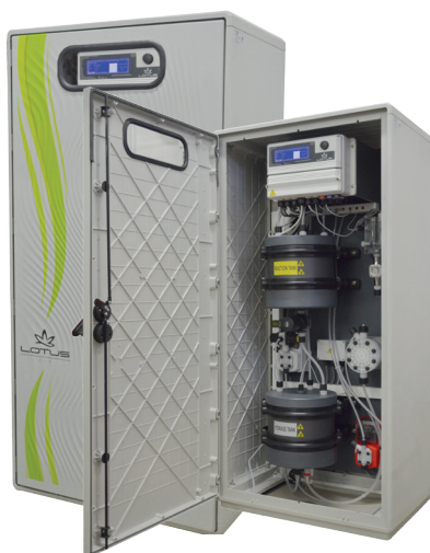
LOTUS AIR 30/60 with probe measure