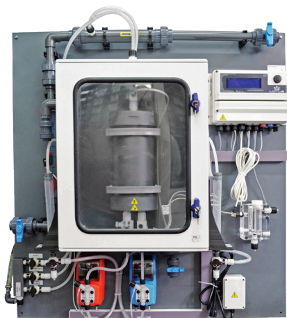
LOTUS MAXI from 80 to 240