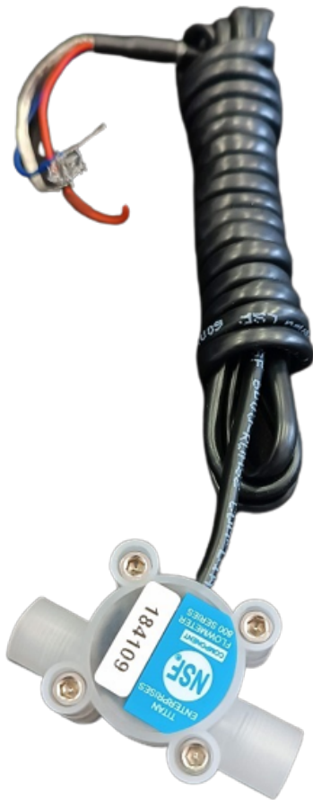
SPECIAL VERSION THREADED 1/8" BSP F