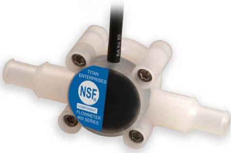
STANDARD VERSION FOR TUBE 8 / 12 mm